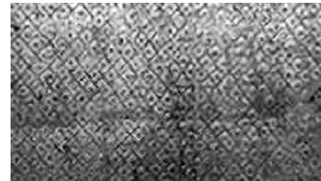
Fig. 4. Microphotographs showing the structure of (a) An unfelted single-bark Fijian masi wedding-sash (see Fig. 5), showing the careful spreading of bark fibers during beating (author's collection); (b) A piece of white, "watermarked" Hawaiian kapa . The final "watermarked" texture was applied by careful beating with an i'e kuku ho'oki ("finishing beater") bearing the 'upena halua pupu design, a grid of diamond shapes with dots in their centers. As can be seen, there is no evidence of the original bark's fiber structure (Dard Hunter collection, RCWAMP #89.2028).