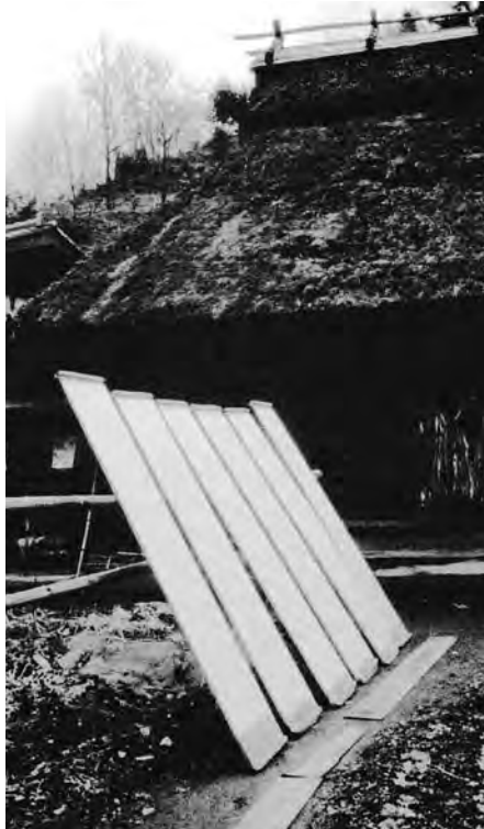
Fig. 3. (b) Drying washi on special drying boards in the cabbage garden, Kurodani village, Honshu, Japan, 1983.

fermentation occurred, the broken-down fibers could in fact be totally pulped and rearranged in a random pattern with the beater, not merely spread out in their original form. This produced a far more even-textured cloth, to which a pleasing pattern similar to laid paper could be produced by beating the pulp into boards with very fine parallel grooves. This was carried to its extreme in Hawai'i, where the bark was considerably retted, then beaten into pulp with a heavy club called a hohoa . This pulp was then beaten out using finer beaters, and finally it was either "lined" on a grooved board as in Tahiti and the Marquesas, or "watermarked" using beaters with carved patterns on their faces (fig. 4). The resulting bark-cloth was generally thinner and more consistent overall than the felted or glued papers of the Southwest Pacific, but it had superior burst strength, its tear strength was good and consistent in all directions, and while, like any paper, wetting would weaken it, there were no layers as such to delaminate. It looked and behaved, in short, like good-quality handmade paper.