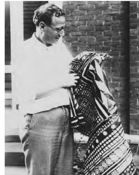
Fig. 1. Dard Hunter admiring a piece of Fijian masi barkcloth from his collection. 6 The characteristic bold geometric figuration on this sample is from Thakaundrove Province in Northeast Fiji (probably the island of Taveuni). The piece he is holding may be RCWAMP item #89.2139. 78 x 65 inches (1.98 x 1.65m). 7

tion, implements and specimens relating to the making and decorating of bark-paper (1927). As mentioned above, he also gave a brief account in his book Papermaking (1943) (fig. 1).