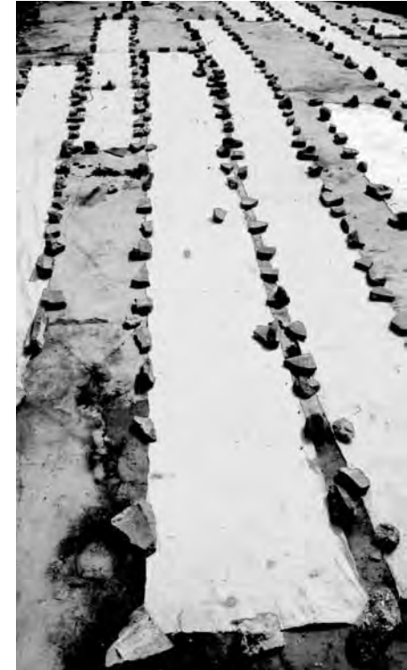
Fig. 3. (a) Drying barkcloth on an old concrete slab, Taunovo village, Vatulele Island, Fiji, 1985. All of these pieces have two or more modules end-joined together, except one in the top right which is a “half-length” made by felting two halves of one bark together. Photo: Rod Ewins, 1980.

In Eastern Polynesia they discovered that if the already-separated bast was itself further stored under cover so that